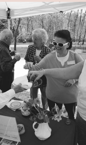
Visitors sample nineteenth-century treats at the Workers' Heritage Fest.